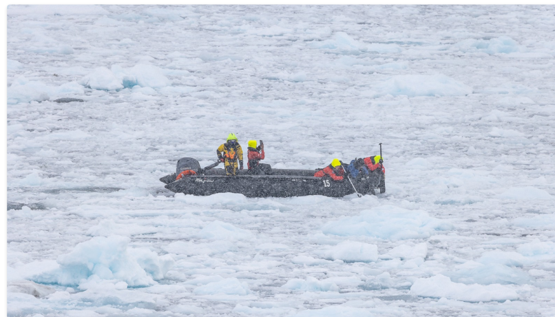
Icy landing site