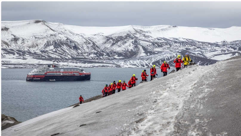
Crater ridge hike