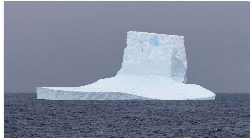
The first iceberg