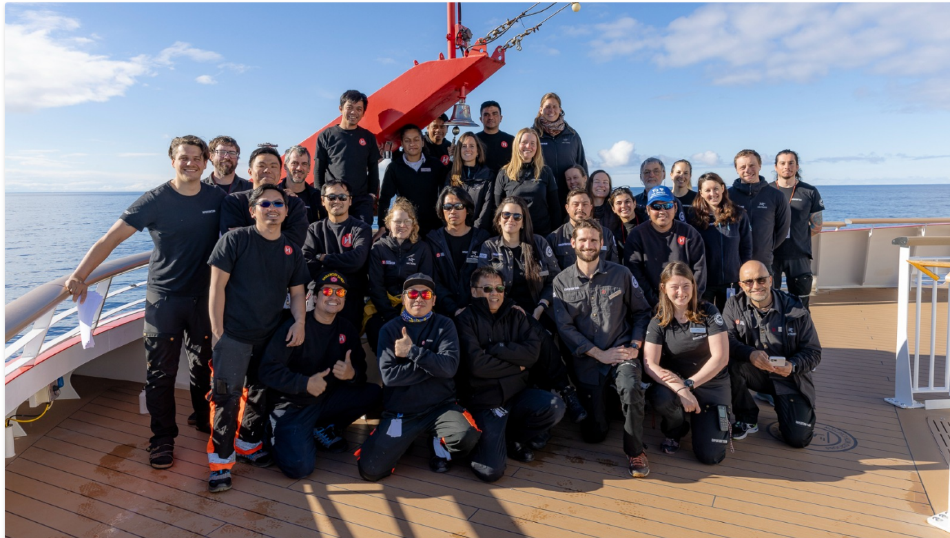
Deck & Expedition Team