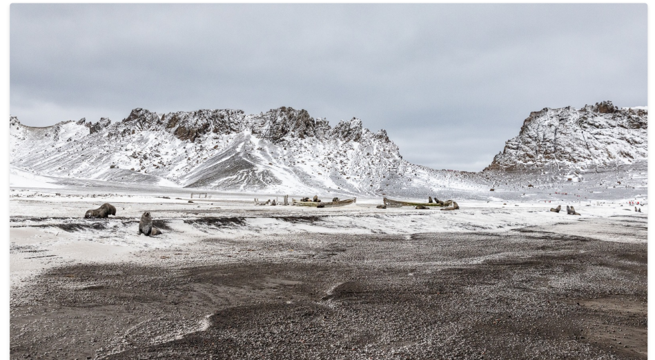
Fur seals took over