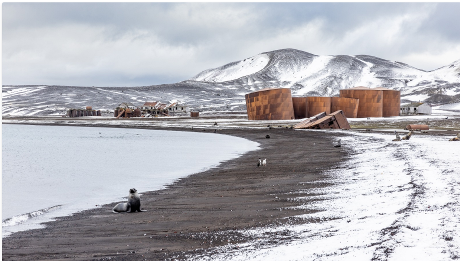
Historic remains from whaling